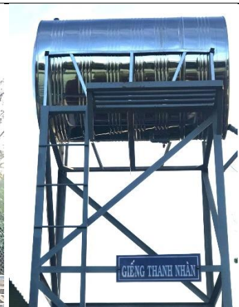
Fig. 10. The new water well Thanh-Nhan after drilling 1300m deep at IA Hét tribal village.