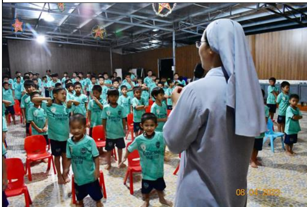
Fig. 6. Children at the cleanly tiled multifunction room