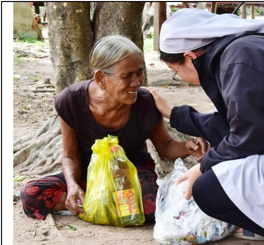
Fig. 8. Tender moment of a Sister and senior Montagnard at Bong K'Lar tribe