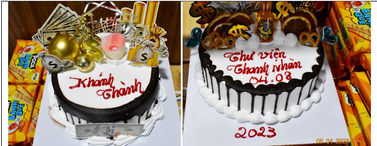
Fig. 1. Cakes for the inauguration of Thanh-Nhan library