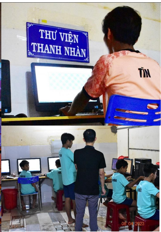
Fig. 4. Students with new computers and instructors