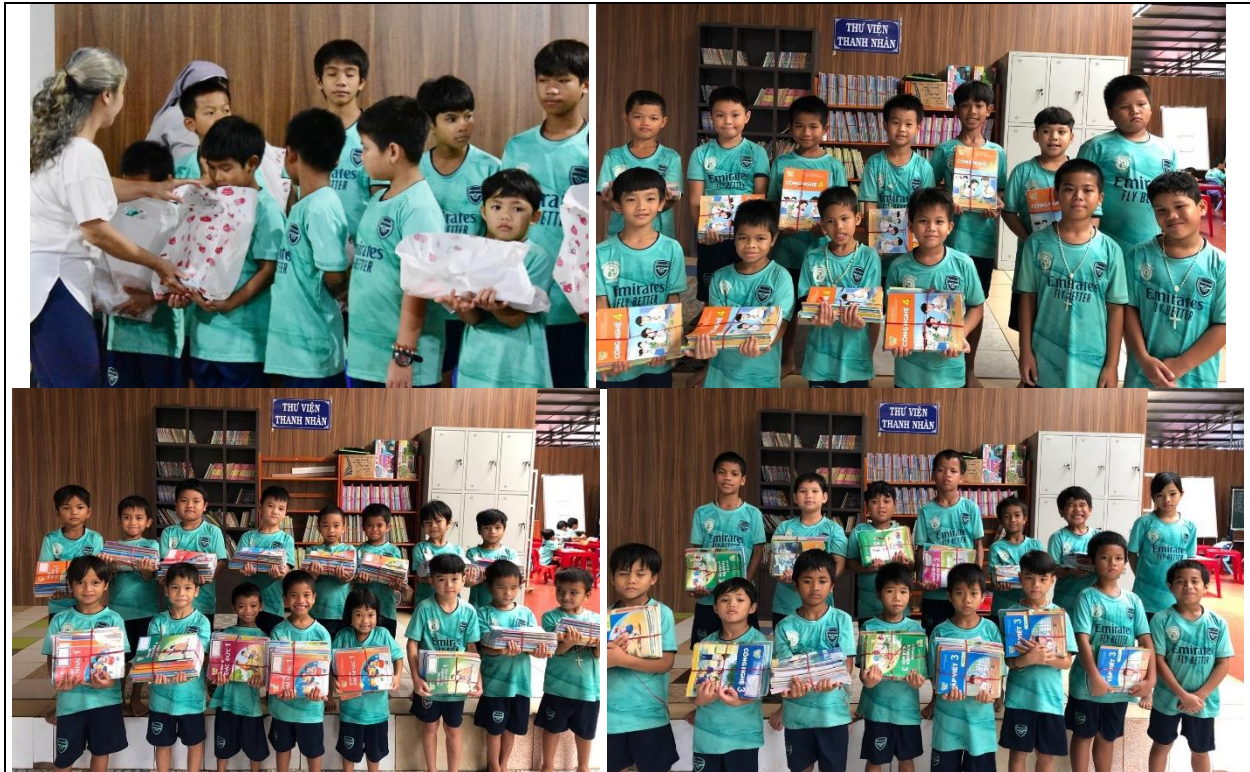
Fig. 5. Awards to outstanding students