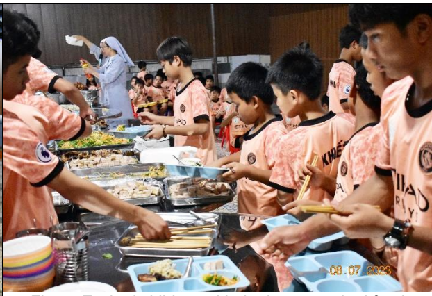
Fig. 7. Excited children with the home-cooked food