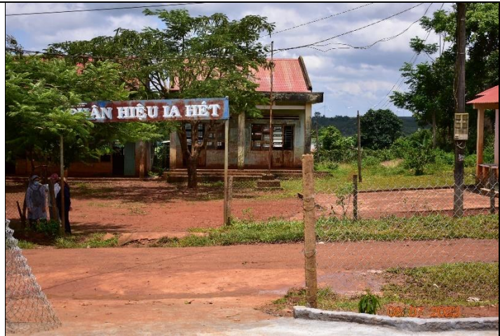
Fig. 9. Site of the proposed Thanh-Nhan water well in IA Hét near Bong K'Lar tribe