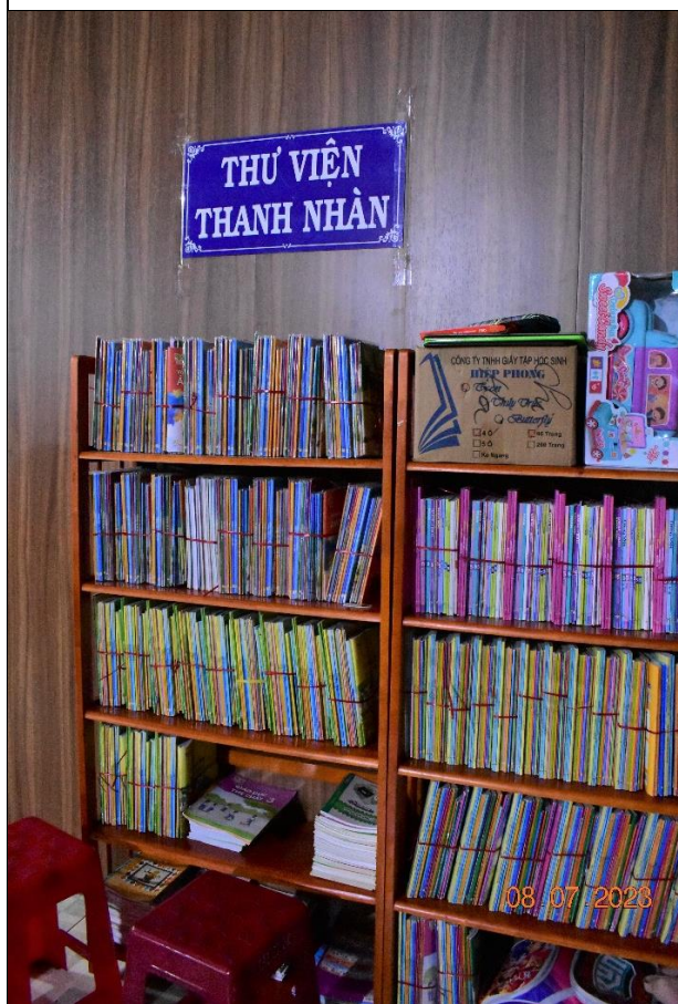
Fig. 3. Textbooks and reference books