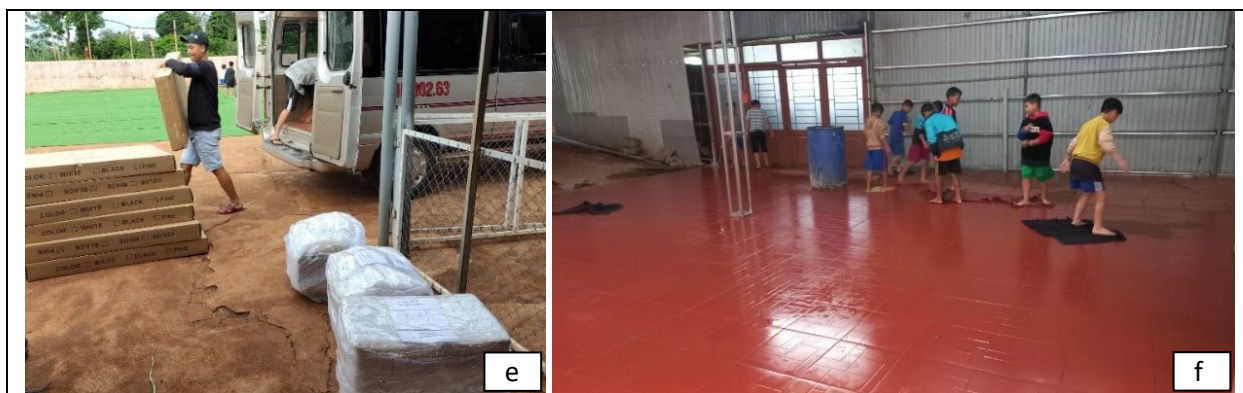
Fig. 2. (a-e) Renovation of the facility for Thanh-Nhan library, and (f) help from students