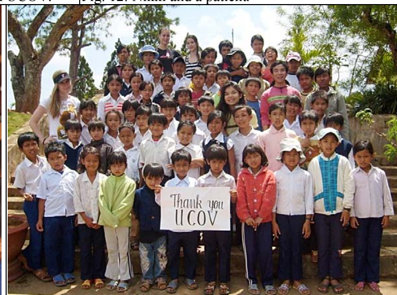
Fig. 14: Children of the lepers show their appreciation to UCOV-UWC and its representatives.