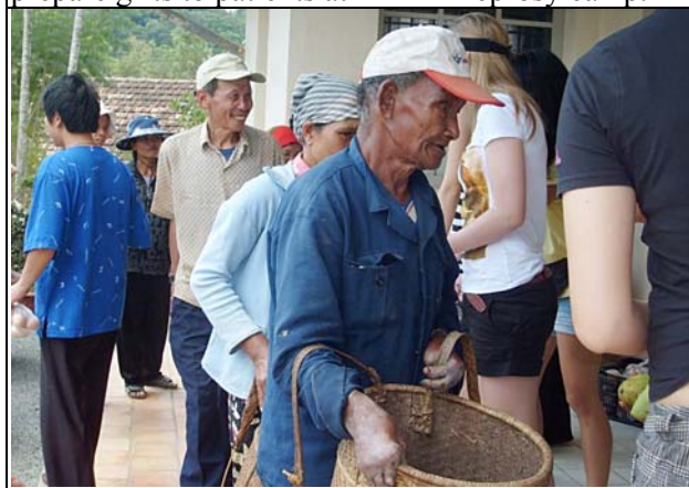
Fig. 11: A patient awaiting his gift from UCOV.