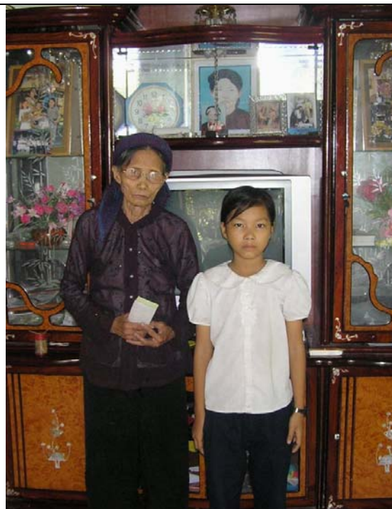
Fig. 2: Loan and her grandmother at their home.