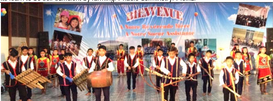
Fig.7: Students keep their heritage by speaking their own languages and mastering their tribal musical instruments. Phaolo dormitory, Pleiku.