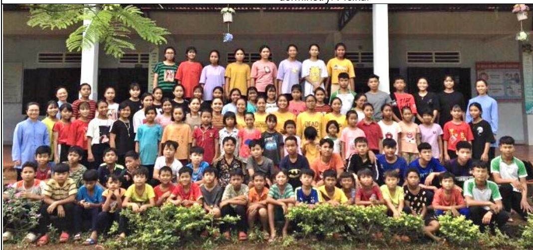
Fig.8: Minority students at Nu Vuong Hoa Binh dormitory in Binh Phuoc