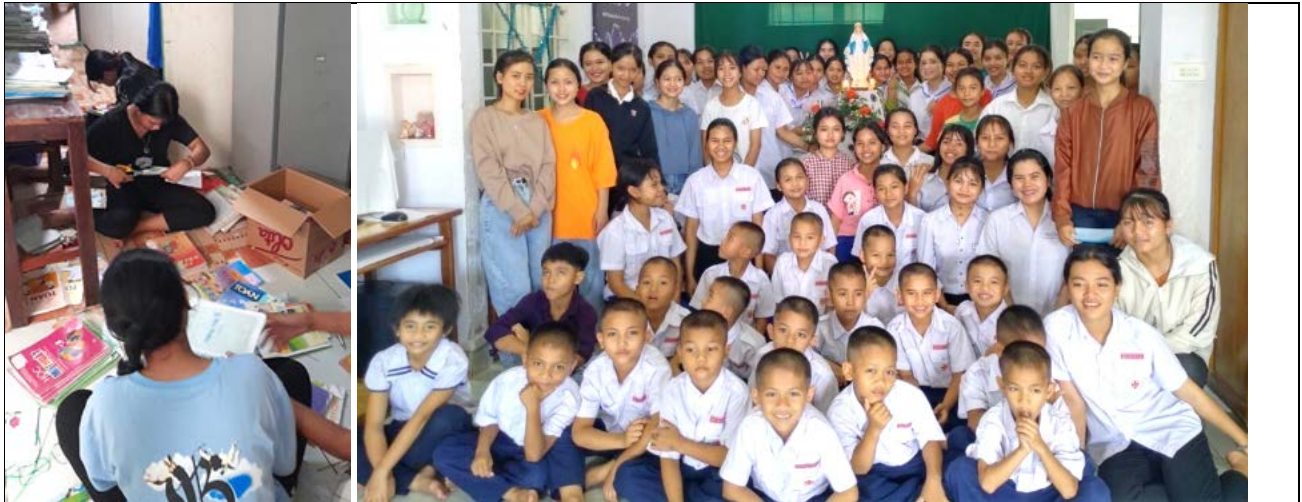
Fig.1: Minority students from Vinh Son dormitory pack their books (left) and move to the new place (right). Dakkia, Kontum.