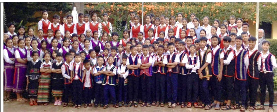
Fig.5: Minority students in traditional costumes at Phaolo dormitory, Pleiku