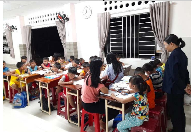
Fig.3: Study hall for children at the new dormitory. Dakkia, Kontum.