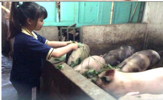
Fig.6: Students learn to be self sufficient by farming, Phaolo dormitory, Pleiku.