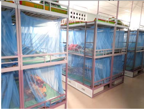
Fig.2: FOU provided relief fund and support for the move to new dormitory at Dakkia leprosy community.