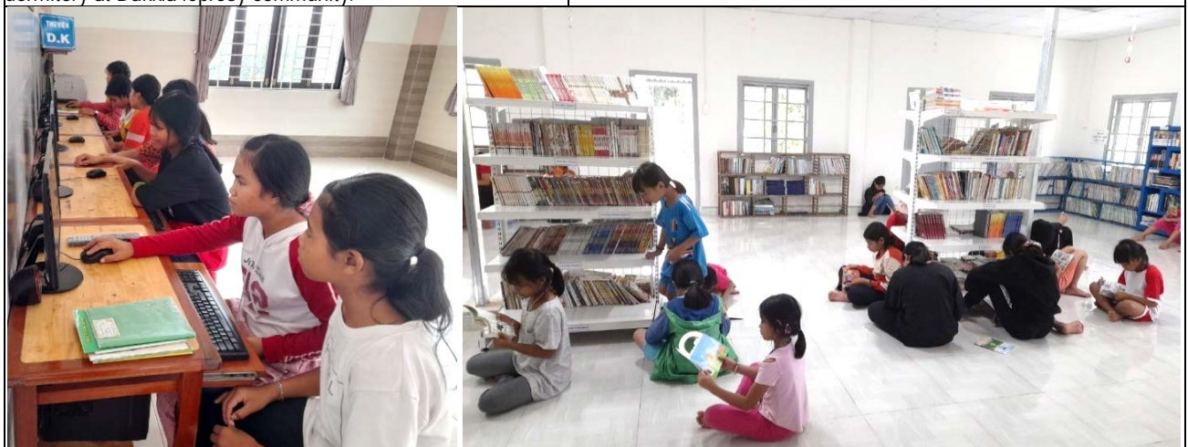
Fig.4: The new location of FOU-sponsored DK library. Dakkia, Kontum