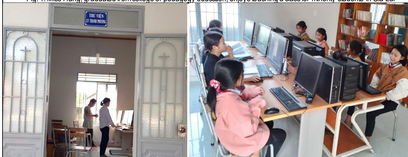
Fig. 2: The 1 st Ly Thanh Phuong library with upgraded PCs. Cam Ranh