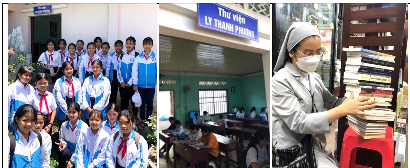
Fig. 3: The 2nd Ly Thanh Phuong library. Kontum