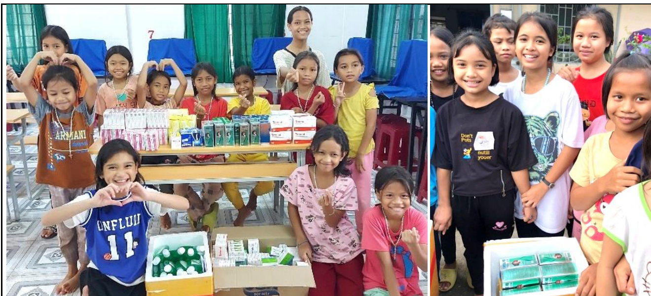
Fig. 5: Medicine for Thien An and Teresa dormitories. Pleiku and Kontum