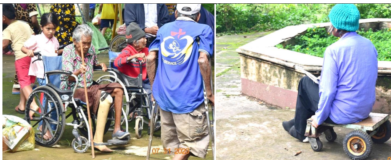
Fig. 14. Patients awaiting gifts at Eana leprosy community in Dak Nong Buon Ma Thuot.