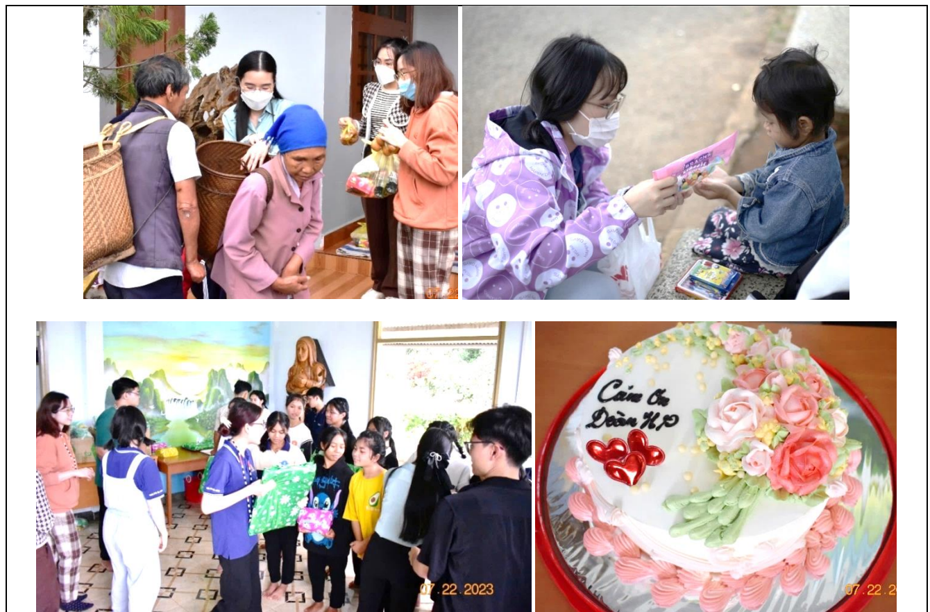
Fig. 1. Members of HP school with patients and students. Di Linh leprosy community.