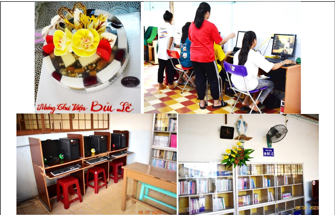
Fig. 7. Celebration at Bui Le library in Pleiku.