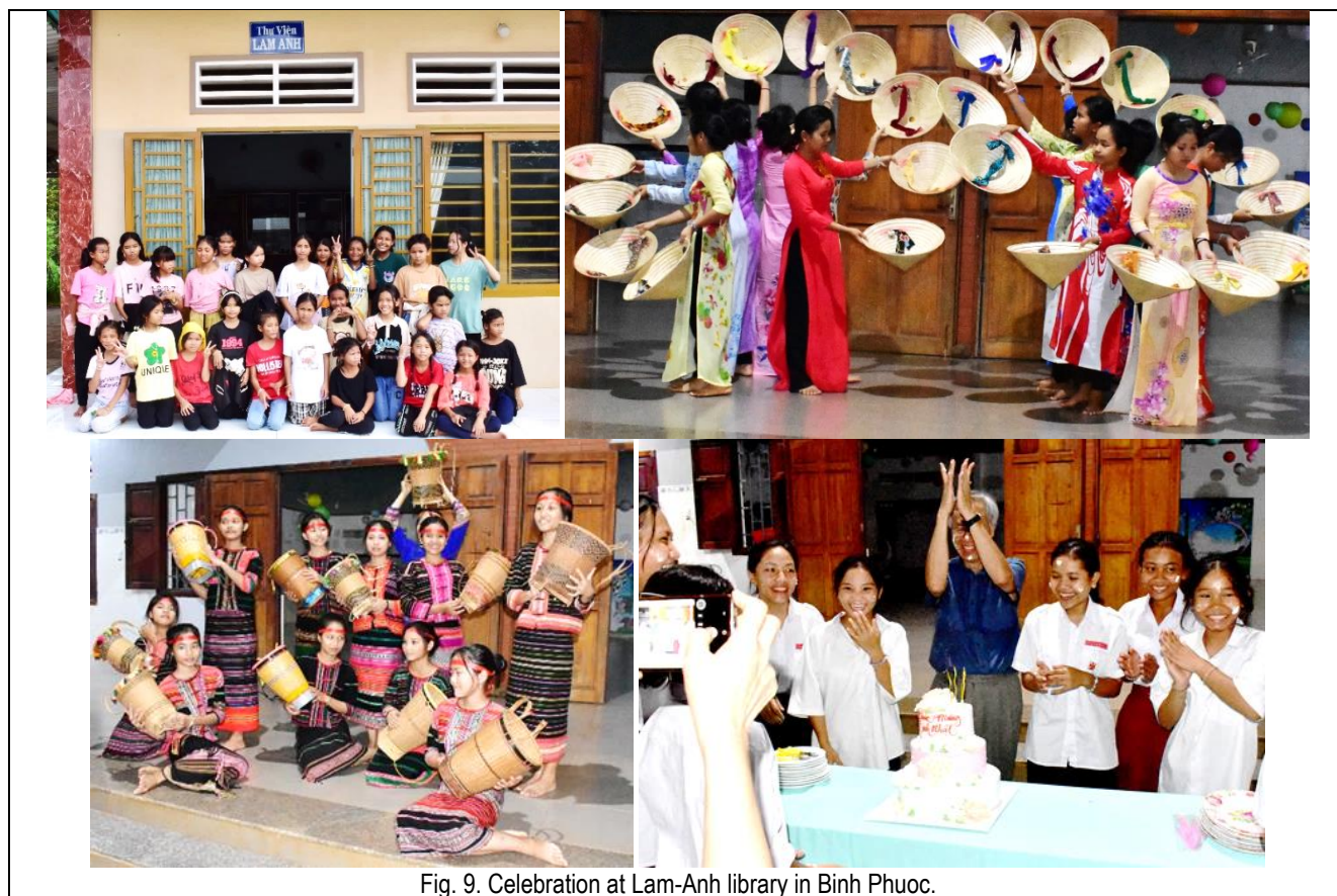
Fig. 9. Celebration at Lam-Anh library in Binh Phuoc.