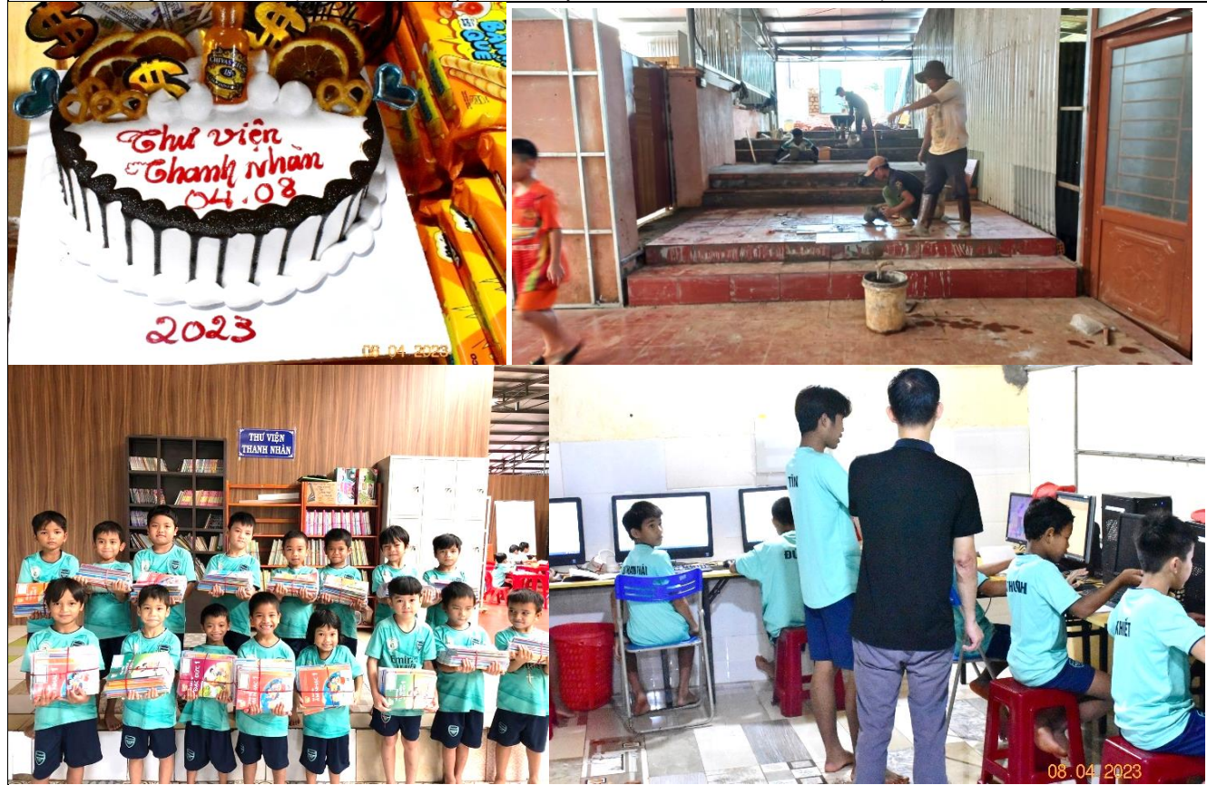
Fig. 11a: Construction and celebration at Thanh-Nhan library in Pleiku.