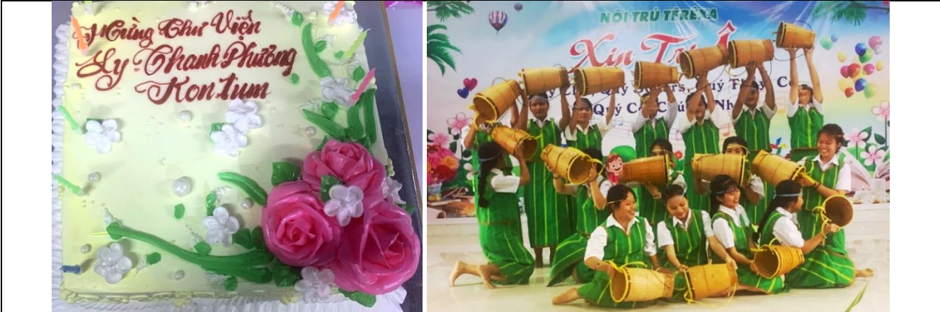
Fig. 5a: Celebration at LyThanhPhuong library in Kontum