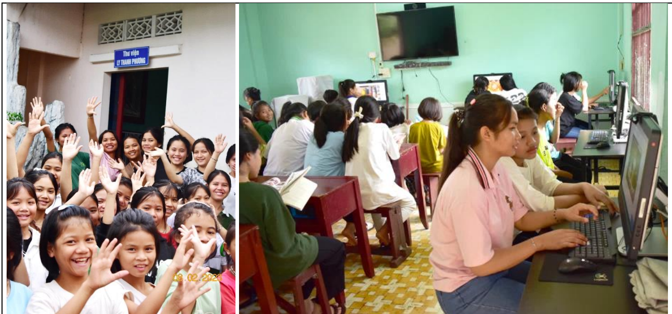
Fig. 5b: Celebration at Ly-Thanh-Phuong library in Kontum