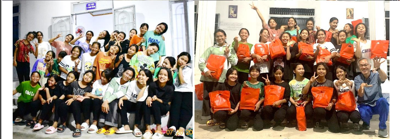
Fig. 4. Celebration at Ly Thanh Phuong library in Cam Ranh