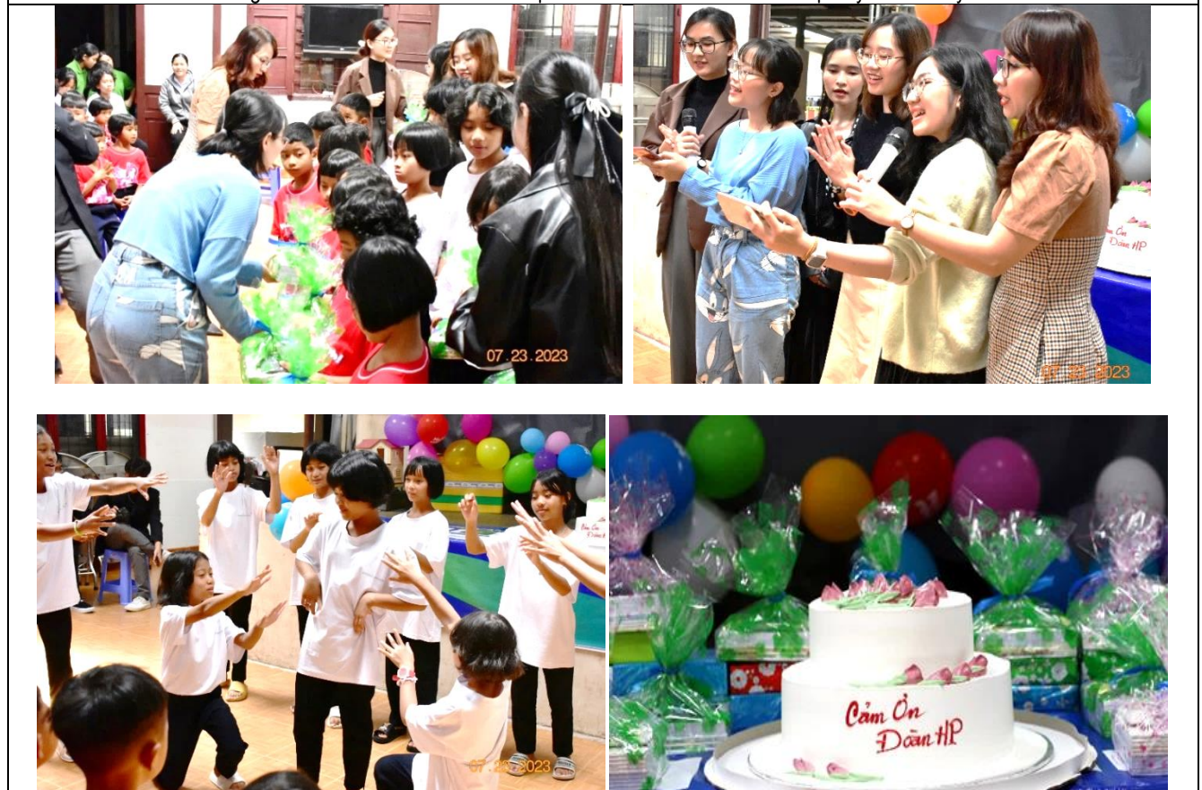
Fig. 2. Members of HP school and students at CamLy dormitory in Dalat