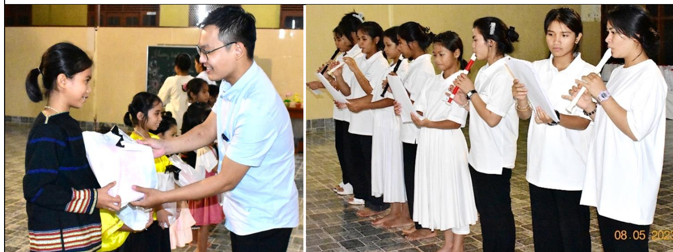
Fig. 11c: Celebration at Dinh Vu library in Pleiku.