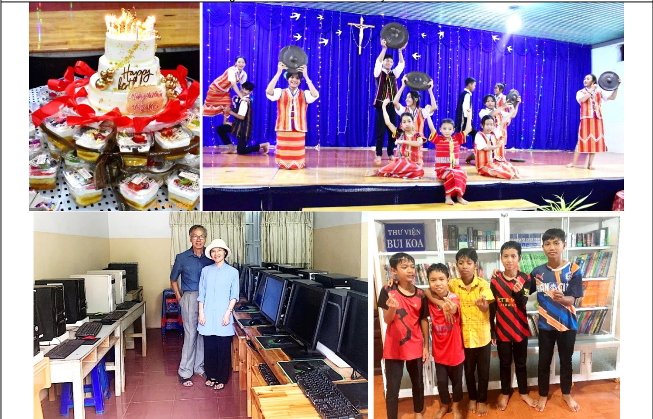
Fig. 8. Celebration at Bui-Koa library in Binh Phuoc.