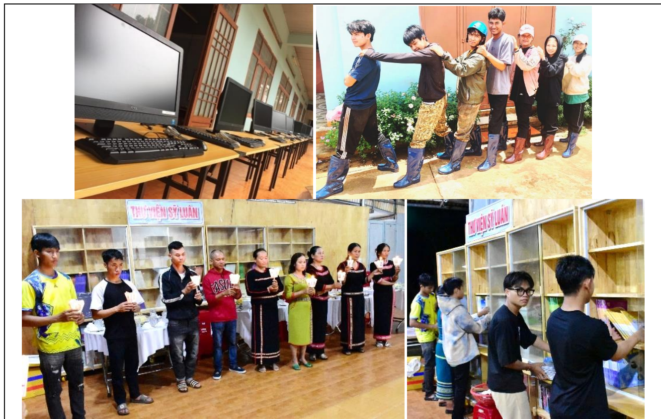
Fig. 10b. New computers /books at Sy-Luan library and new boots to student farm helpers in Buon Ma Thuot.