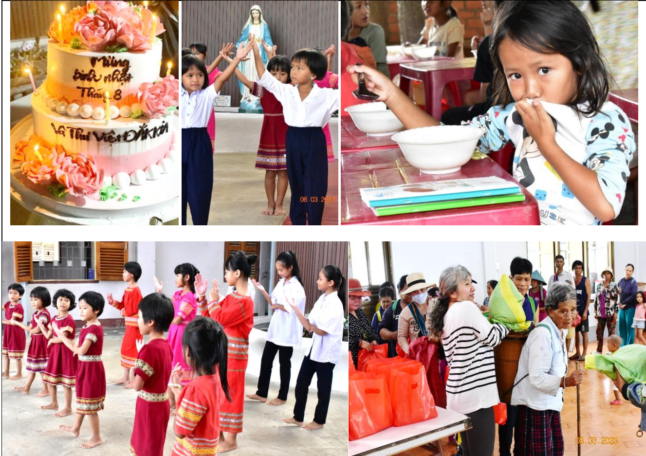
Fig. 6: Celebration at D.K. library and visit to Dak Kia leprosy community in Kontum.